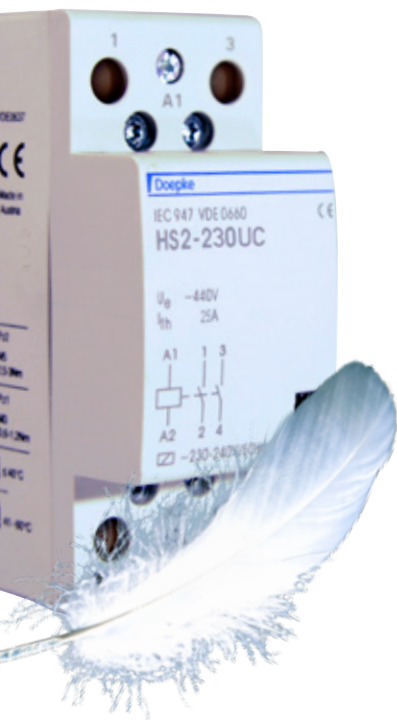
Unbelievably quiet: Doepke-contactors work away undetected (Image similar)

four normally opened contacts, two normally opened contacts and two normally closed contacts, or three normally opened contacts and one normally closed contact. Taking up just two module widths, these compact devices are no bigger than their low-noise counterparts. Familiar accessories, such as the HSH 11 auxiliary switch and the HSP seal caps, are also compatible with these new installation contactors. They will be available once the new 2017 price list comes into effect.