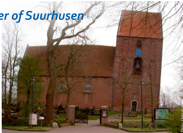
Suurhusen, a village near Emden, is home to the most leaning tower

but as the church continued to lean more and more, it had to be closed. Renovation work was able to begin after DM 200,000.00 was pulled together by donations and Lower Saxony state treasury funds. Experts