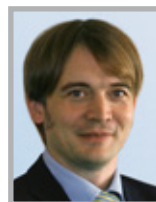
Heino Thoben-Mescher Product Management

The new NA switch offers this very emergency stop loop connection option. The isolating device required here has to be able to disconnect all active conductors including the neutral conductor and AC-DC sensitive residual current circuit-breakers have to be used too. The Doepke DFS 4 B NA combines all of these properties in one device.