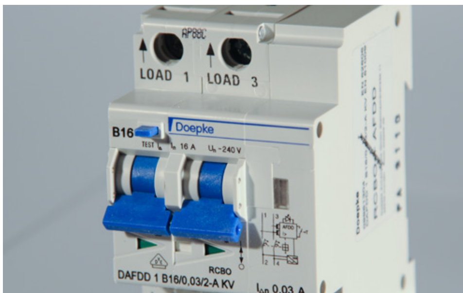
Don't give arc faults a chance: get a DAFDD.

When tripped, an LED display shows the source of the fault. Information on the cause of the fault is stored and can be reviewed at a later date. The AFD and RCBO units each have separate displays to give a clearer picture of the situation.