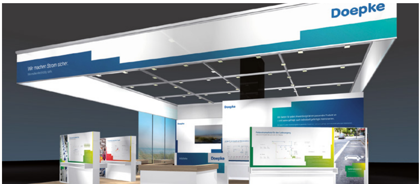
Open, bright, friendly: Doepke's stand at Light + Building 2018

Half the width – all the protection ..... 7 A new face in our Accounting and Audit Department ..... 8 Keeping a tradition alive ..... 8 On top in Dubai ..... 8