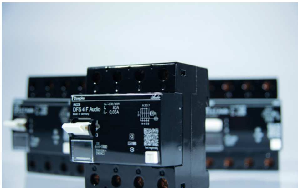
Jet black, pearl white controls, gold-plated terminal connectors: the DFS 4 Audio is instantly recognisable.

On various Hi-Fi forums the issue of power supply to Hi-Fi equipment, and specifically the use of residual current circuit-breakers, appears again and again. And again and again you read that some Hi-Fi enthusiast or other runs their unit without residual current circuit-breakers for sound reasons – an absolute no-no! This is despite the fact that section 411.3.3 of DIN VDE 0100-410 411.3.3 states very clearly that socket outlets of up to 20 A designed for general use by untrained individuals must be protected by I\Delta n \leq 30 mA RCDs. That also applies to any socket to which Hi-Fis are connected.